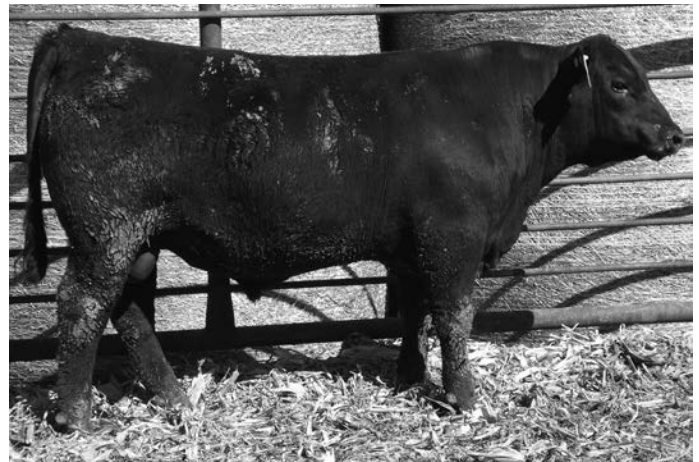
Lot 27 | General Aberdeen KD 979

Long, thick-made bull that is one of the top performing bulls. His dam goes back to the great Juanada donor cow that was purchased in 1993.