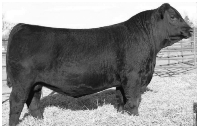
SAV Angus Industry 3229 | Reg: 17633744