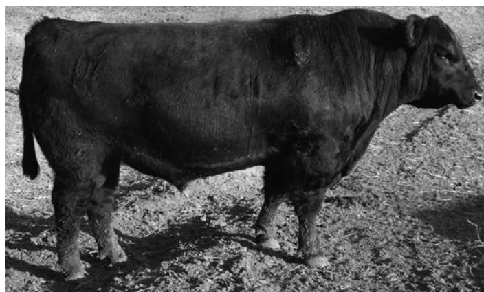
Lot 55 | General Traveler KD 8102

CW I+36 MARB I+.05 RE I+.59 FAT I-.002 $B +111