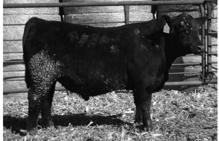
Lot 42 | Treffer Safeguard 934

Big, thick, high-growth bull. Dam has 3 at 100.