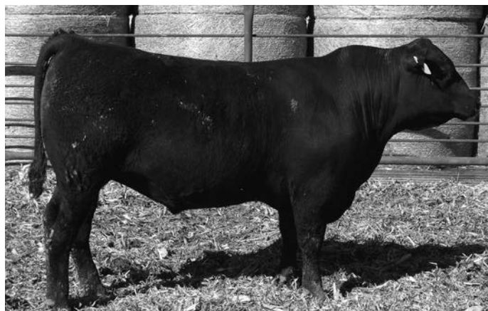
Lot 15 | Treffer Summitt 928

Impressive herd bull. Our heaviest weaning bull out of a Pathfinder dam with 6 at 110. No creep feed operation.