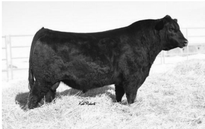
Basin Payweight Plus 6048 | Reg: 18511911