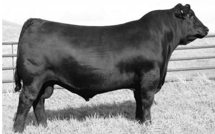
SAV Renown 3439 | Reg: 17633839