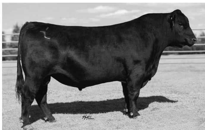
Barstow Banker B76 | Reg: 18034104