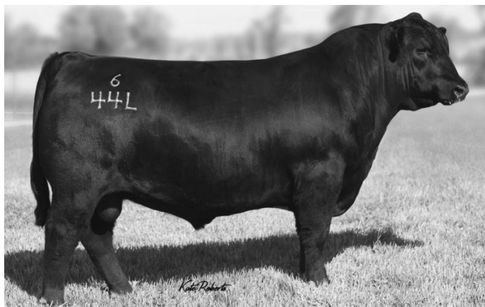
Connealy Legendary 644L | Reg: 18534952