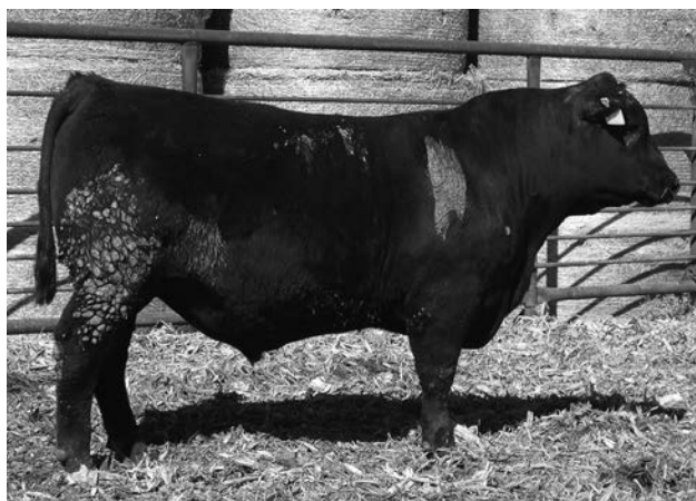
Lot 21 | Treffer Pay Dirt 916

A definite calving ease bull with a big EPD spread. Lots of volume and is in the top 1% for $M or maternal weaned calf value. Pathfinder dam has 4 at 108.