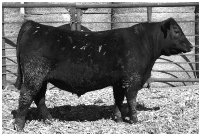
Lot 38 | DAR Industry 985

This is a really good, stout-made bull. He is deep and extremely thick. This is likely the best Industry bull ever produced. His dam is an AAA Pathfinder cow and always has top performing calves.