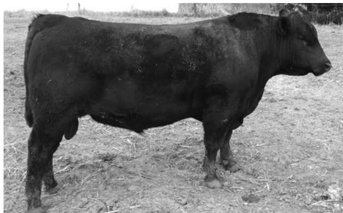
Lot 56 | DAR General 899

Large framed, long-sided bull. A lot of growth and performance. Dam was shown at state and national Angus shows.