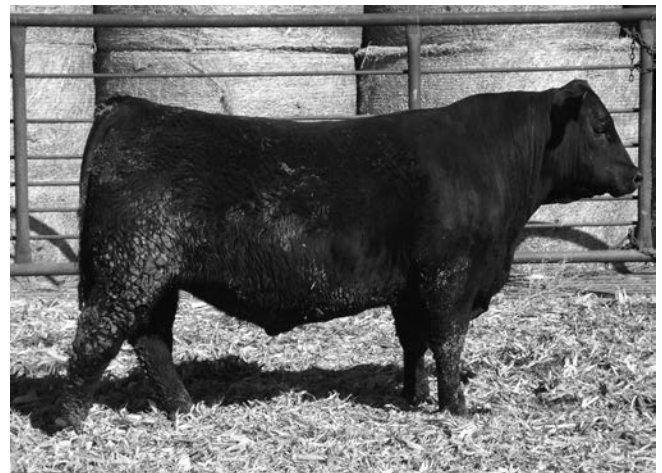
Lot 8 | Rainfall Product KD 939

Calving ease bull that is royalty bred. He is stout made, extremely thick and very stylish. His dam is an AAA Pathfinder and is Dad's favorite cow out of the great Polly cow.