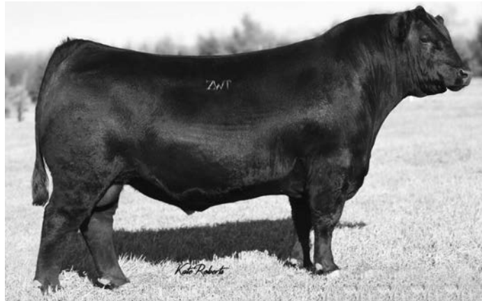
ZWT Summitt 6507 | Reg: 18561289