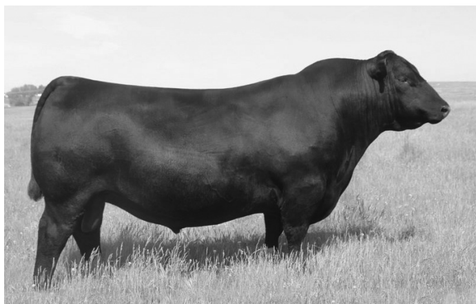
SAV Rainfall 6846 | Reg: 18578963