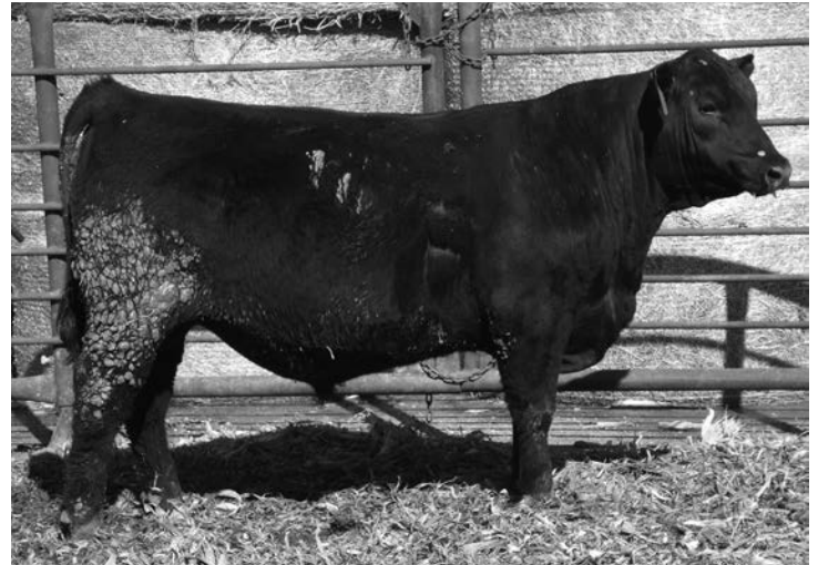
Lot 4 | Treffer Rampart 921

Soft made Rampart out of a Final Answer daughter with 5 at 98.