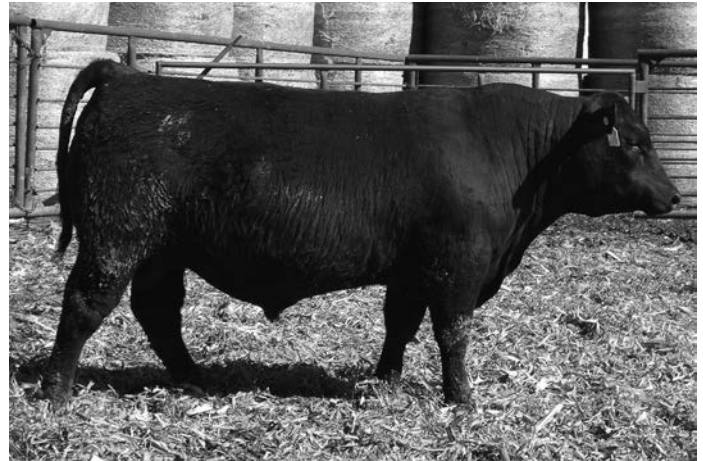
Lot 6 | Rainfall Industry KD 911

Featured bull that is calving ease and power. Heavy muscled and smooth shoulder. The dam and grand dam were both shown on the state and national levels.