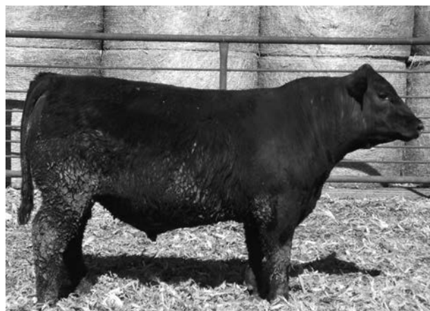
Lot 19 | Pay Weight Pioneer KD 936

Maternally oriented Pay Dirt son. Top 20% of all bulls for docility and $ indexes for energy an maternal. Dam has 7 at 104.