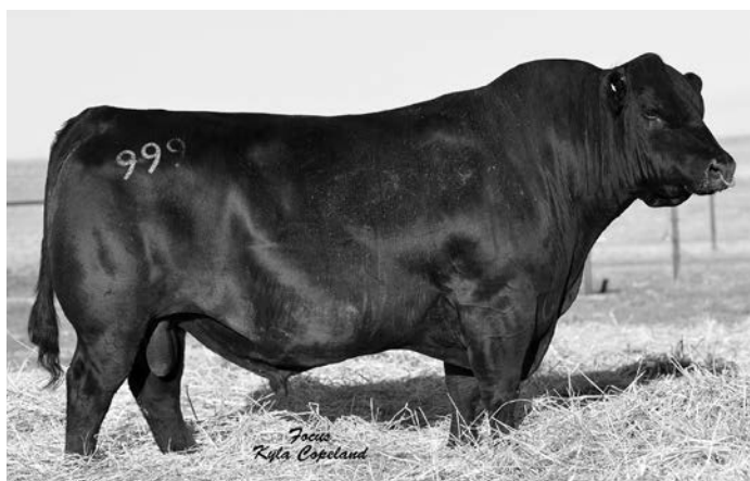
LD Emblazon 999 | Reg: 16665803