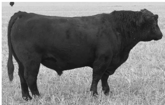
Connealy General 633L | Reg: 18542053