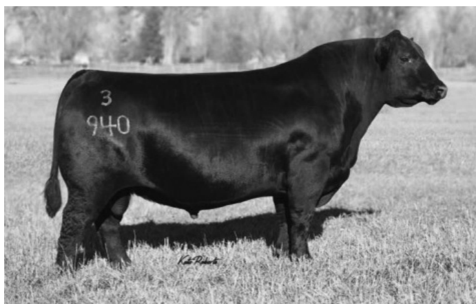
Sire of: Woodhill Reliance C189-E33 Connealy Confidence Plus | Reg: 17585576