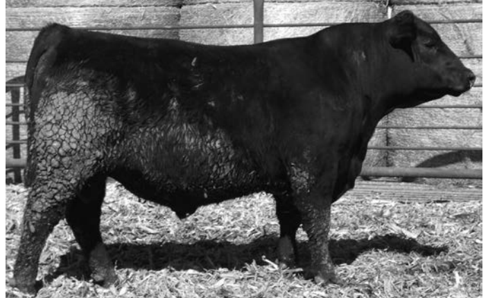
Lot 11 | Renown Forefront KD 921

A true sale feature. He is a big, soggy-built bull that has a lot of power. He was the top gaining bull on test at 4.9. His dam is a daughter of our Evergreen donor so power is in his blood.