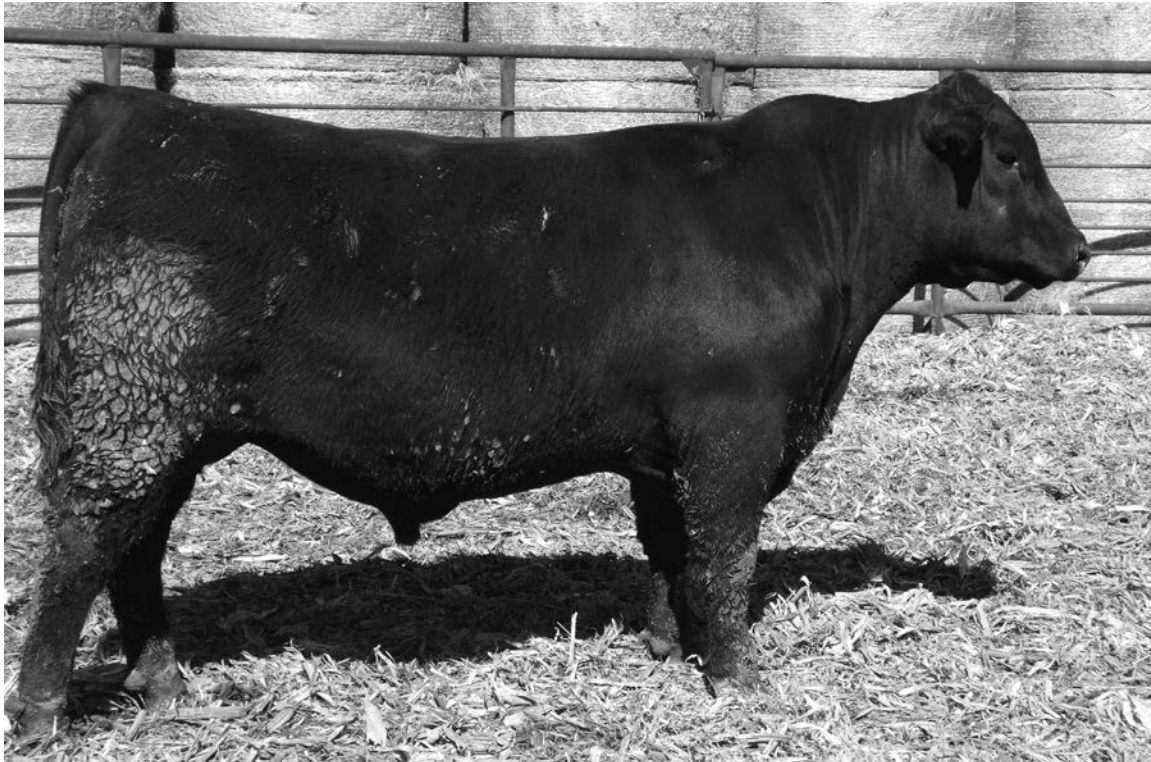
Lot 1 | DAR Legendary 929