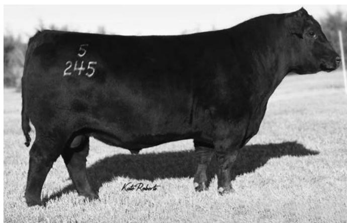
Connealy Rampart | Reg: 18227118