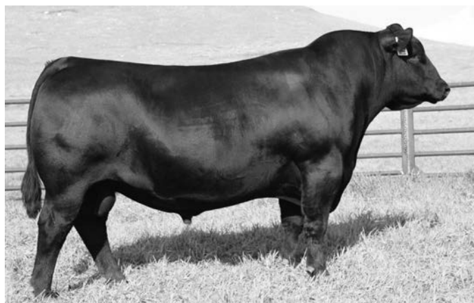
SAV Registry 2831 | Reg: 17318928