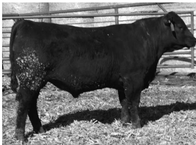
Lot 10 | Treffer Registry 917